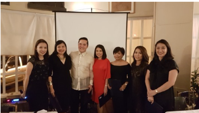
The new set of officers of PPDSI

Held at the Last Chukker of the Manila Polo Club, it was attended by some PPDSI members and a few dear friends of PPDSI who has helped the society the past years. The new set of PPDSI officers took their oath of office as well.