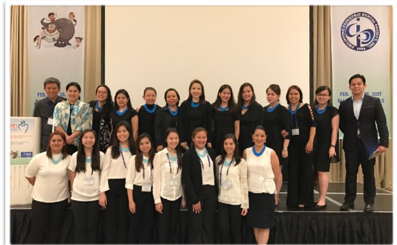
The organizing committee of the joint congress of the 24th Annual Convention and the IAPD Regional Meeting held at Blue Leaf Filipinas, Parañaque last Feb 27 & 28, 2017.