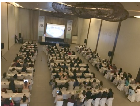
The seminar hall

Procedures and Trauma in the Early Mixed Dentition. The delegates listened intently on these two topics, as it was interesting and fascinating to listen to.