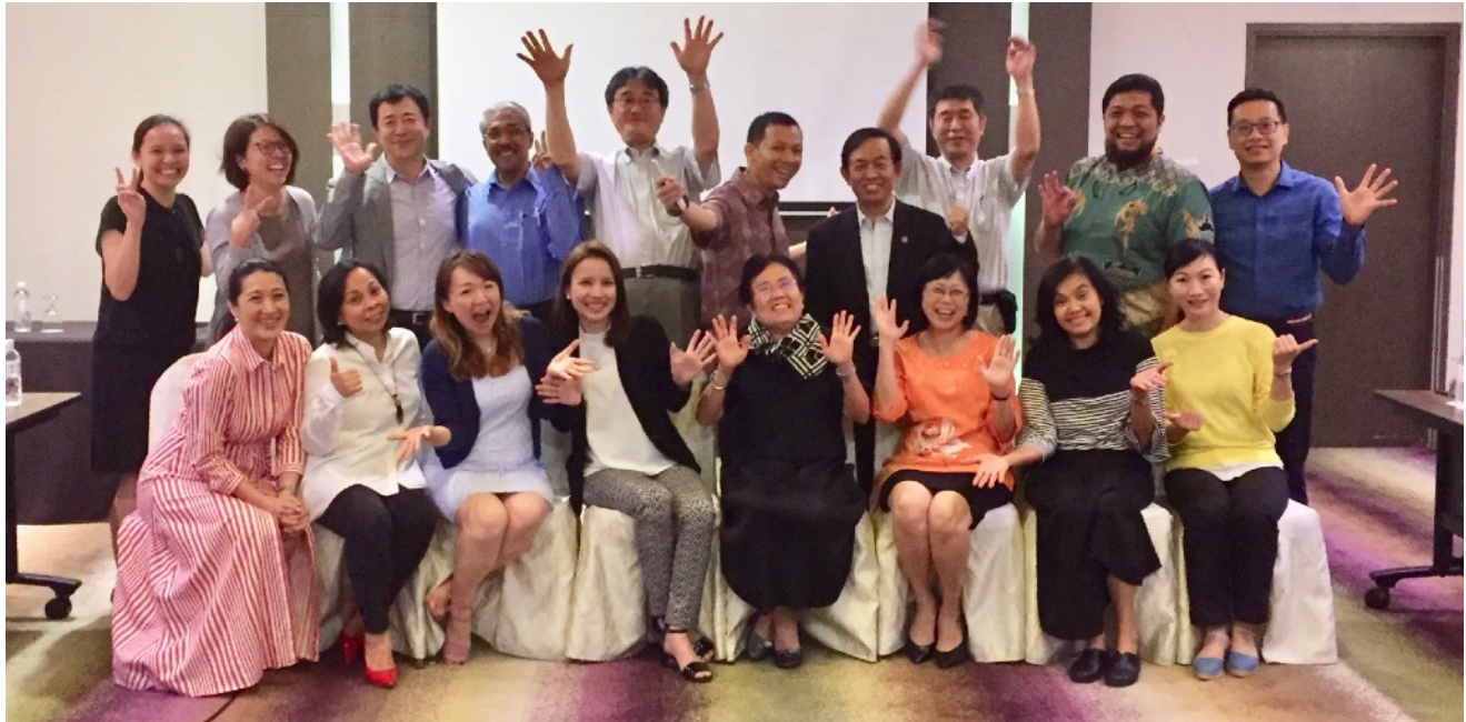
The PDAA Board from the Philippines, China, Hong Kong, Japan, Indonesia, Japan, Korea, Malaysia, Taiwan and Thailand.