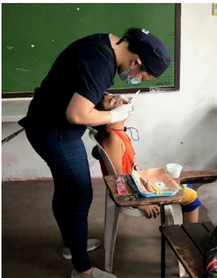
San Isidro High School Rodriguez, Rizal Nov. 26, 2017

Procedures done: Oral health education (mothers' class) Oral exam and topical fluoride application Caries Risk Assessment